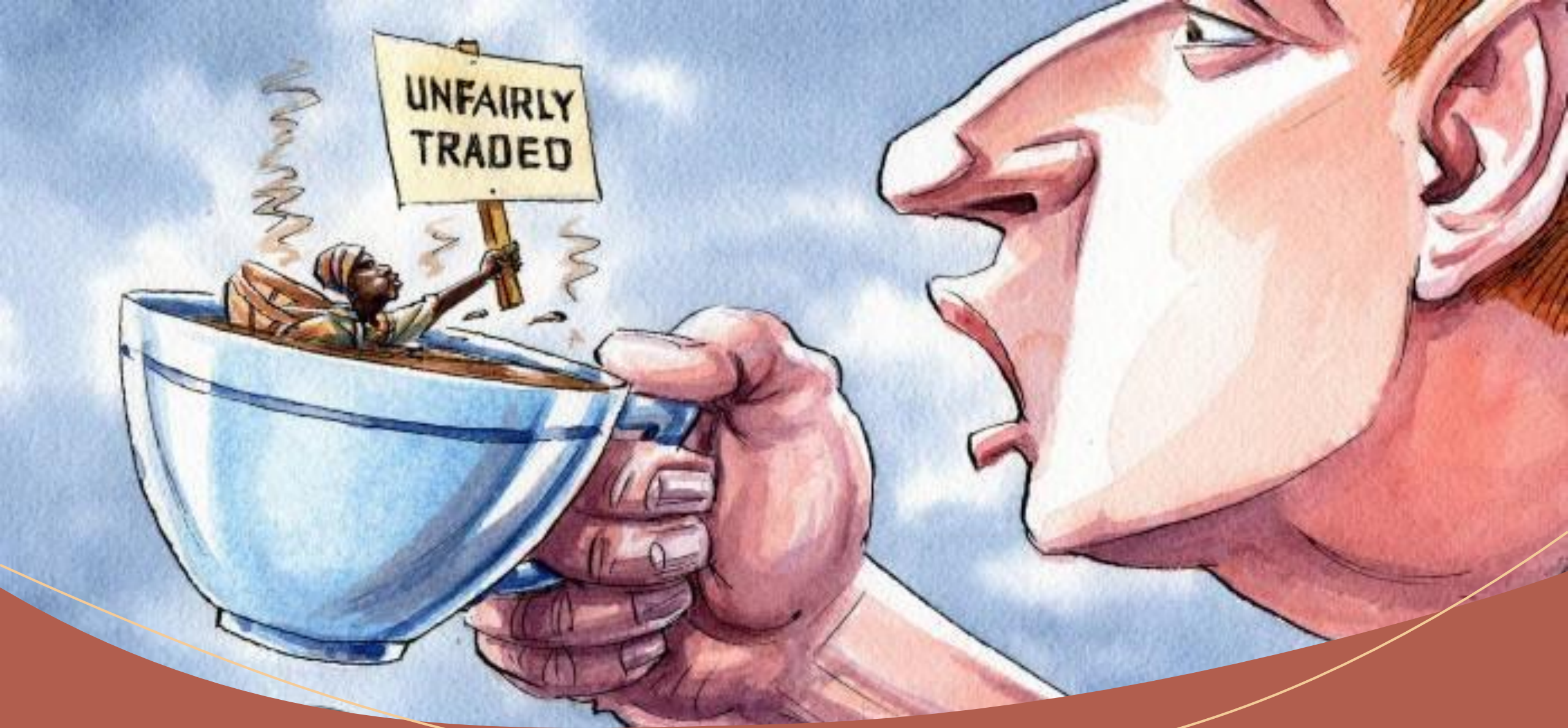
Image found: https://medium.com/illumination/neocolonialism-how-western-corporations-are-exploiting-africa-d0e197af1950